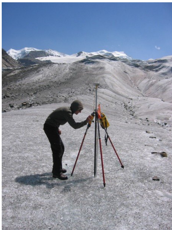
Above: measuring the velocity of the Morteratsch glacier using GPS.