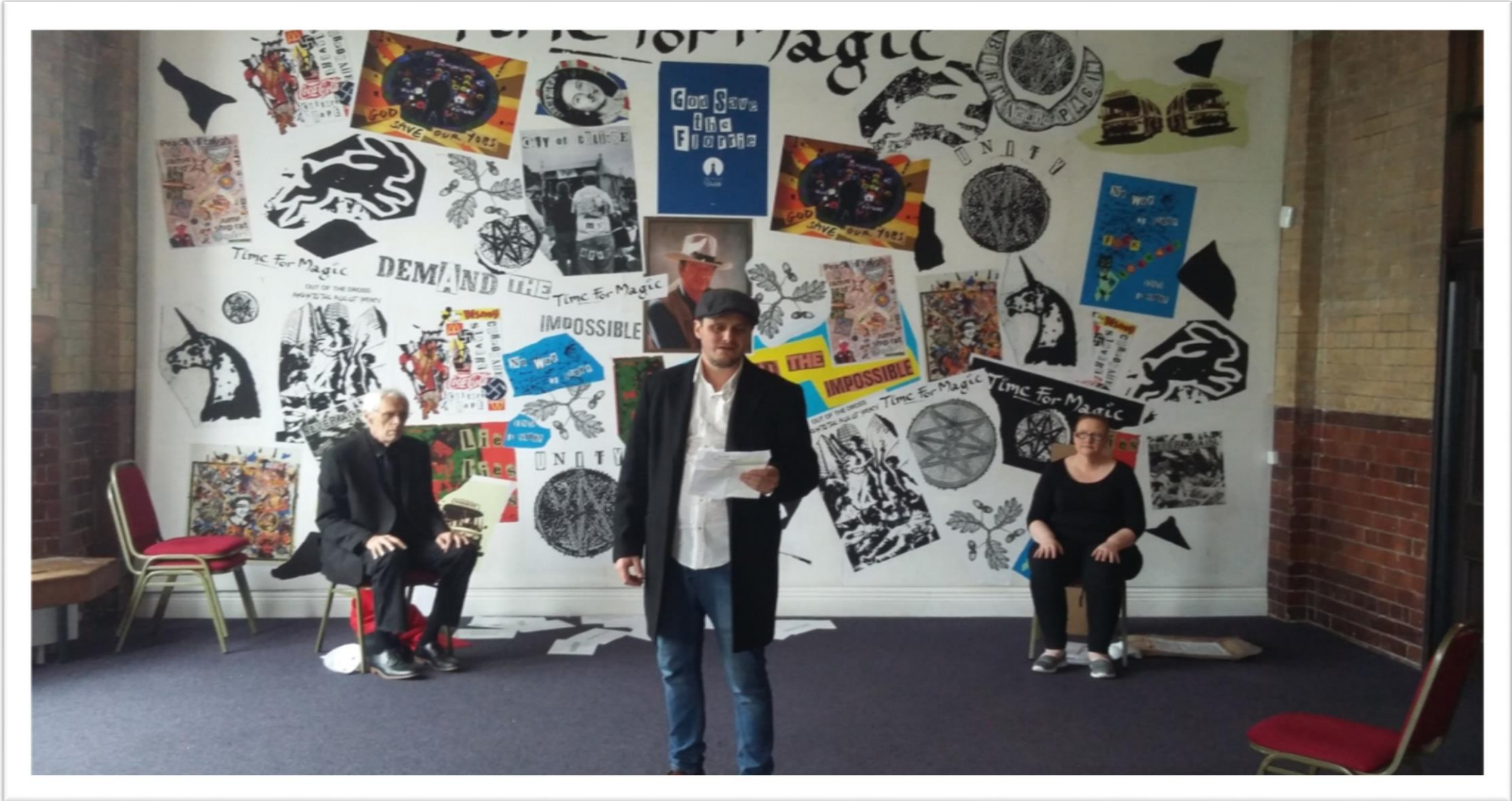
Final show: 'Who Am I?' performed at The Florrie