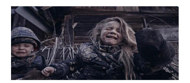
Figure1: Primary health problems of child and adolescent asylum seeker or refugee