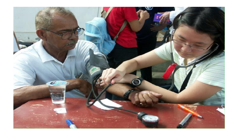
Figure1: Primary health problems of adult asylum seeker or refugee