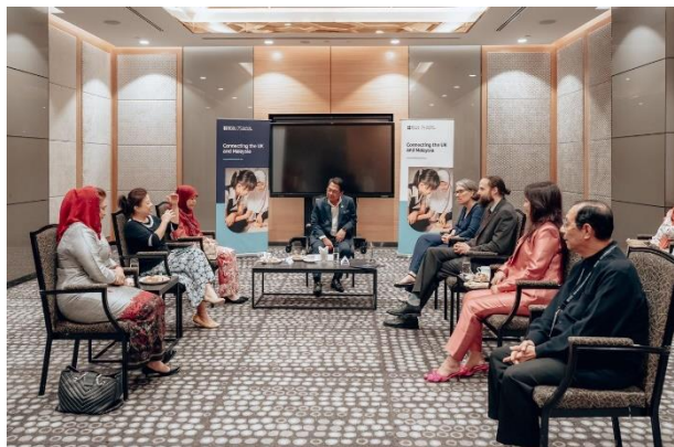
UK-MUC Moving forward meeting on 21 February 2024