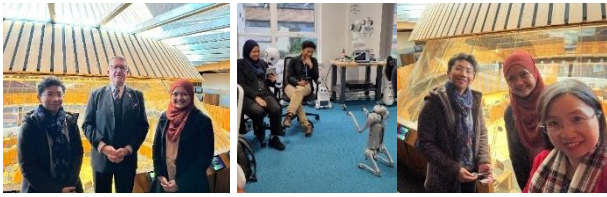
Visit to Welsh Parliament for policy impact inspiration & Robotics demo at EUREKA Robotics Centre during CNY.