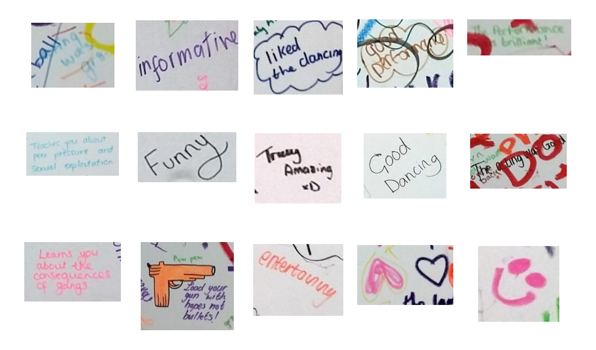
Figure 2: Selected positive text and images from the canvases

The responses were overwhelmingly positive and Figure 2 includes a range of these enthusiastic words and images such as 'brilliant', 'amazing' and 'well good' together with smiley faces. A drawing of a gun is coloured in a soft orange and the text beside it reads: 'Load your gun with hopes not bullets!'