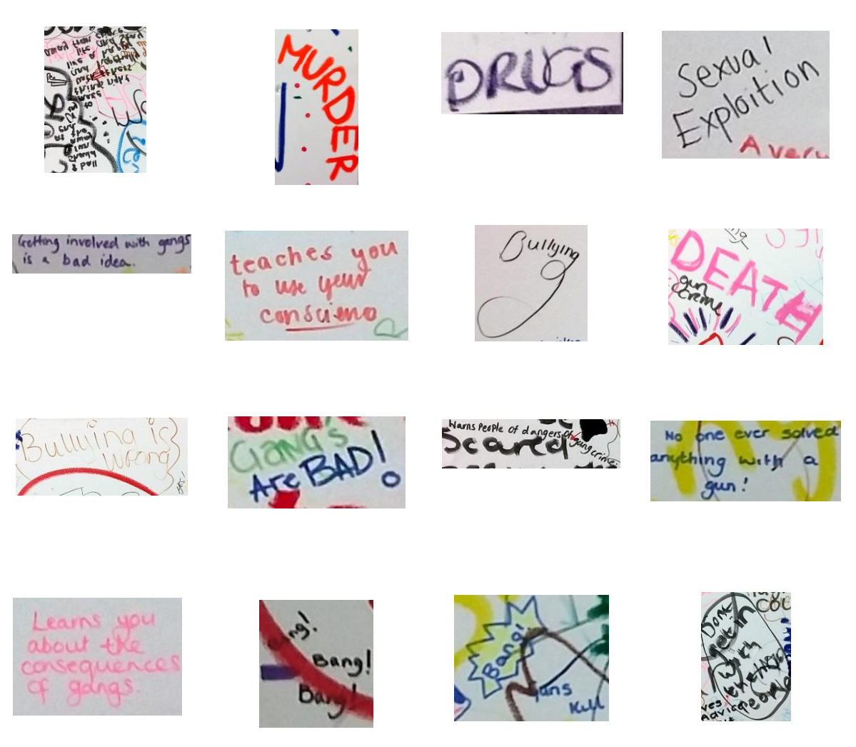
Figure 4: Selected thematic text and images from the canvases

The immediate responses from the case study school revealed that young people had successfully identified the play's key themes. For example, elements of the canvases illustrated young people's assessments of the consequences of 'gang membership' and the use of weapons; they also referred to peer pressure and sexual exploitation (see Figure 4).