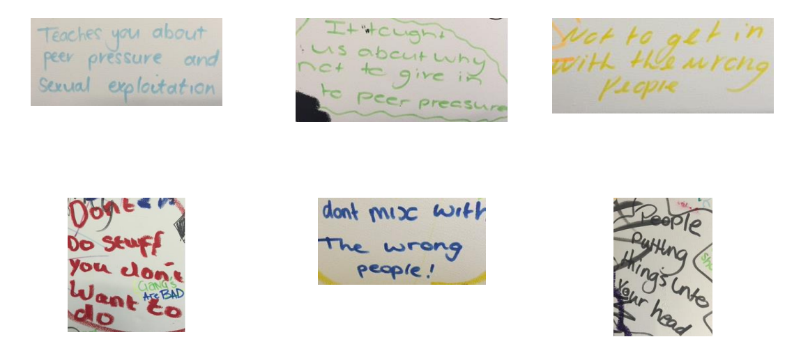
Figure 7: Selected text and images on peer pressure from the canvases

The Development Manager told us that she had always regarded the 'core issue' of the play to be 'gun and gang crime'. However, a young person had disagreed with her and said, 'No, it's peer pressure'. The video data and the canvases also saw multiple references to peer pressure, a theme that was relatable for many audience members, and one which often appears to be entangled with friendships.