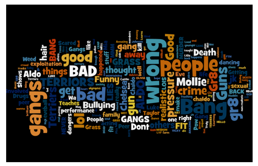
Figure 1: Word cloud depicting text on canvases

The word cloud (Figure 1) comprises of words and phrases that appeared on the canvases. This is a useful way of providing a visual interpretation of free-form text. The size of the words within the word cloud illustrates their frequency of appearance on the canvases. In the videos, the drama was described as 'brilliant', 'funny', 'enlightening', 'inspirational', 'educational' and it 'taught valuable lessons'.